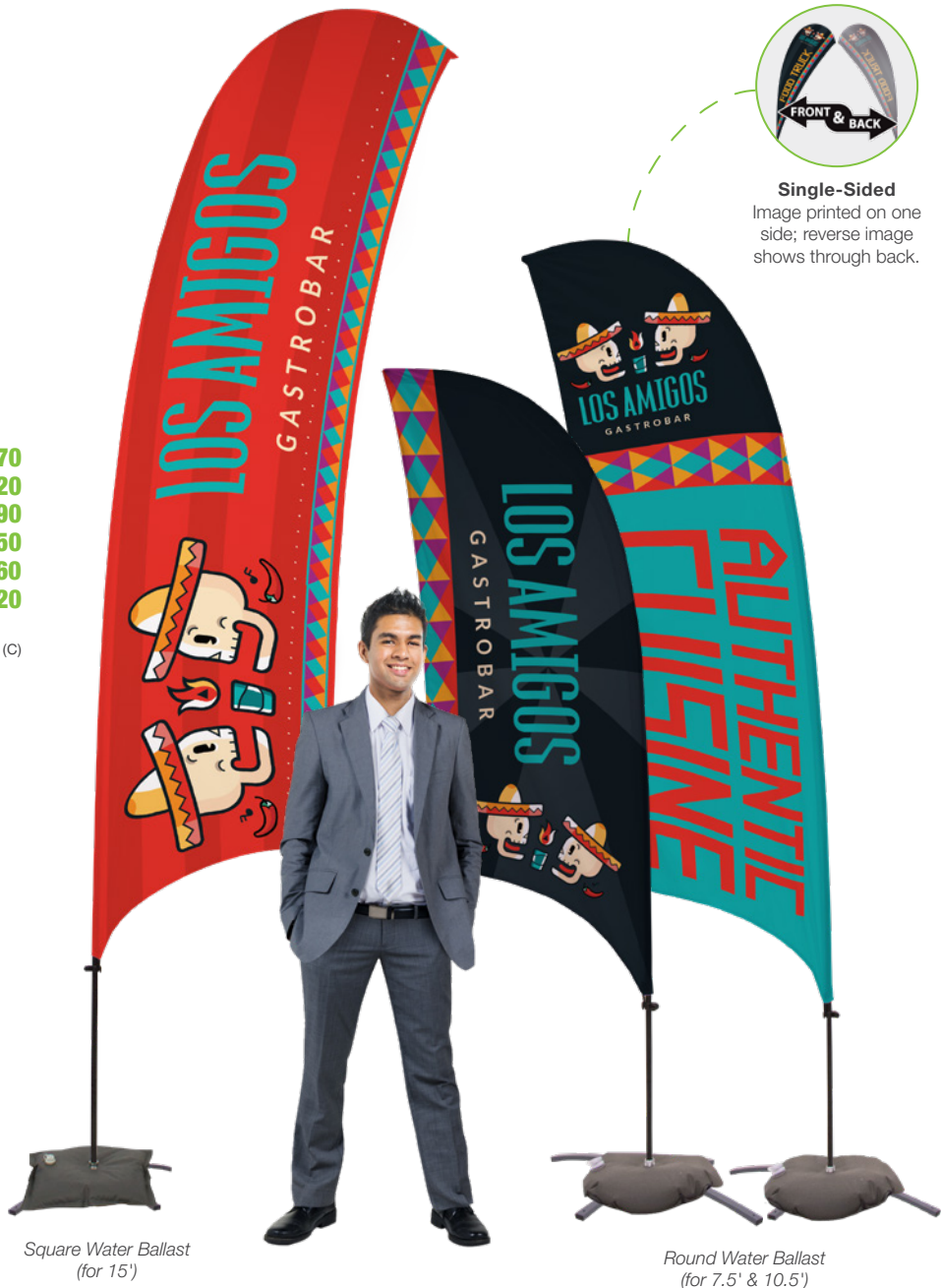
Square Water Ballast (for 15')

A loop on the flag attaches to an adjustable hook on the pole.